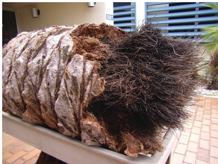
Figure 7. The only tissues remaining in this Phoenix dactylifera trunk section are the fibers (strings). The fungus has degraded the rest of the trunk tissue.