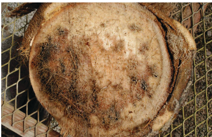
Figure 5. Cross-section of Cocos nucifera trunk illustrating that the rot caused by Thielaviopsis paradoxa occurs on only one side of the trunk and moves from the outside to the inside of the trunk.

Stem bleeding is a common symptom of Thielaviopsis trunk rot observed on Cocos nucifera (coconut). This stem bleeding is a reddish-brown or brown or black stain that runs down the trunk from the point of infection (Figure 6). Since any trunk wound may result in stem bleeding, close examination of the point of infection is required. If the stem bleeding is due to Thielaviopsis paradoxa and the disease has progressed significantly, the tissue immediately surrounding the wound (infection point) will be quite soft in comparison to surrounding trunk tissue. You will be able to push your finger past the pseudobark and into the truck tissue. Palms other than coconuts, especially those with a smooth trunk, may also exhibit stem bleeding, but it seems to be most common in coconut. Eventually, the trunk will collapse on itself at the point of infection. Because the fungus cannot degrade lignin, the trunk fibers are left nearly intact, while the tissue surrounding the fibers is degraded, resulting in “stringy” black tissue (Figure 7).