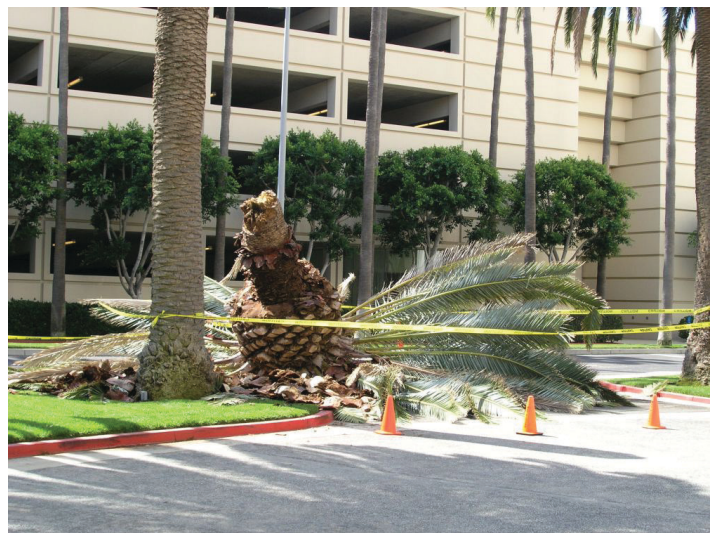
Figure 3. The canopy of this Phoenix canariensis fell off of the trunk due to Thielaviopsis trunk rot.

In the situation where the canopy falls off the trunk, the rot occurs below the bud at the base of the canopy in the woody tissue. This is also an area with little, if any, lignified plant tissue. When the trunk rot is farther down the trunk, this means that the fungus has rotted the trunk tissue until the palm can no longer structurally support itself. Examination of a cross-section through a diseased trunk illustrates that the rot is located only on one side of the trunk (Figures 4 and 5). This is in contrast to Ganoderma butt rot, in which the fungus is at the trunk base and rots from the center of the trunk to the outside. Ganoderma butt rot is discussed at http://edis.ifas.ufl.edu/pp100 .