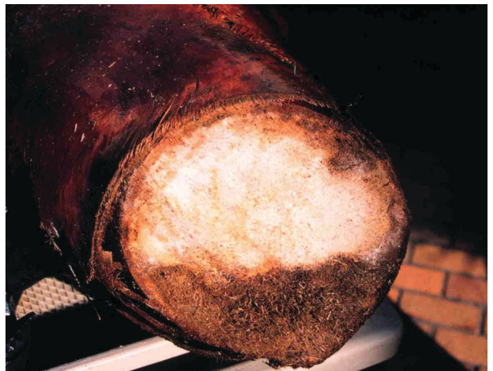
Figure 4. Cross-section of Washingtonia robusta trunk illustrating that the rot caused by Thielaviopsis paradoxa occurs on only one side of the trunk and moves from the outside to the inside of the trunk.

In the situation where the canopy falls off the trunk, the rot occurs below the bud at the base of the canopy in the woody tissue. This is also an area with little, if any, lignified plant tissue. When the trunk rot is farther down the trunk, this means that the fungus has rotted the trunk tissue until the palm can no longer structurally support itself. Examination of a cross-section through a diseased trunk illustrates that the rot is located only on one side of the trunk (Figures 4 and 5). This is in contrast to Ganoderma butt rot, in which the fungus is at the trunk base and rots from the center of the trunk to the outside. Ganoderma butt rot is discussed at http://edis.ifas.ufl.edu/pp100 .