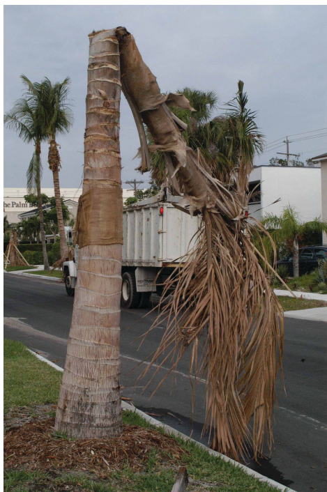
Figure 2. Cocos nucifera trunk collapsed upon itself due to Thielaviopsis trunk rot.